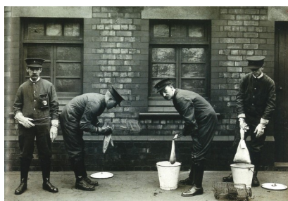
Doused in petrol.

What could these men in Liverpool be dipping in the buckets?