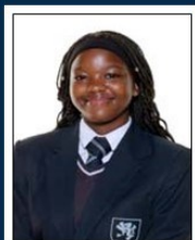
Barona Year 11